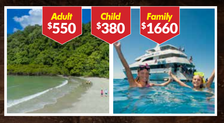
3 DAY OUTBACK + REEF + RAINFOREST