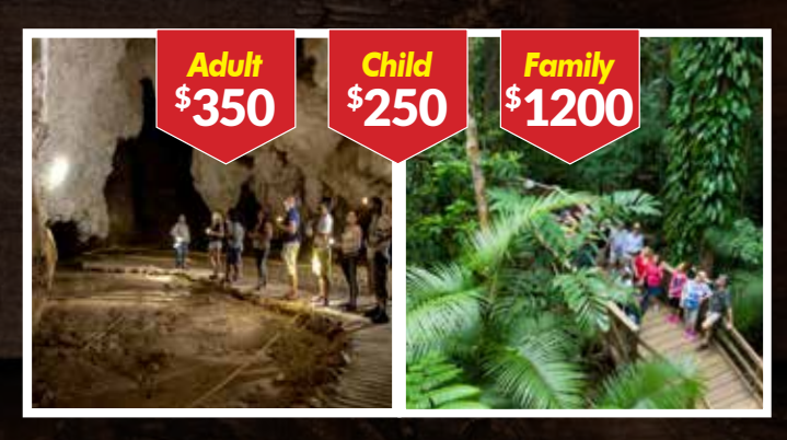
2 DAY OUTBACK & RAINFOREST