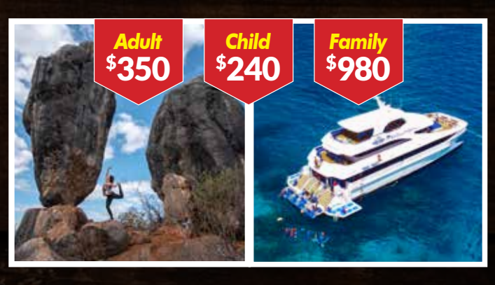
2 DAY OUTBACK & GREAT BARRIER REEF